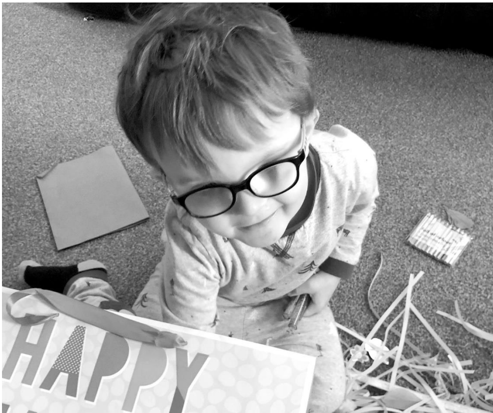
Photo of one of our young clients opening his Easter Activity Pack